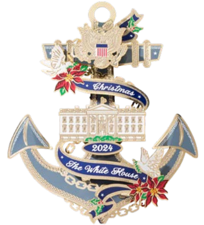
The collection was begun by Jackie Kennedy in 1961 as an enlightenment to the annual Christmas display at the White House. The Official 2024 White House Christmas Ornament honors President Jimmy Carter. The ornament's anchor shape, an iconic symbol of hope, represents Carter's service in the United States Navy.