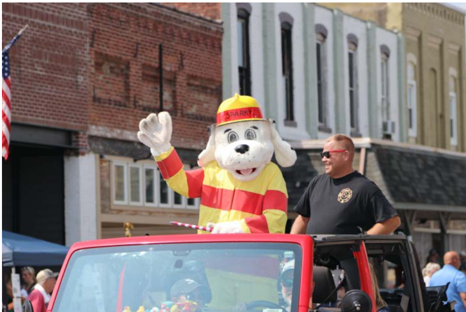
The Fire marshal rides with Sparky in the Jeep parade