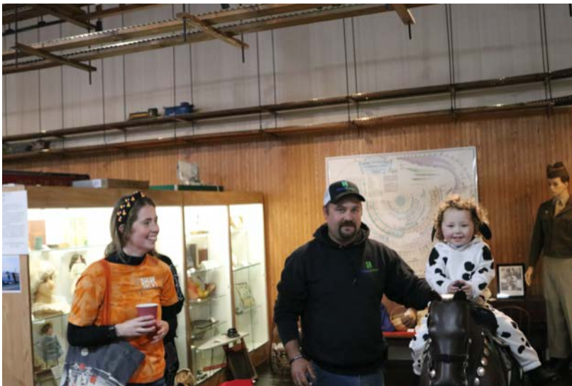
Visitors enjoy riding Sandy, the mechanical horse.