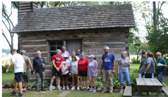
This crew of volunteers helped to clean up the Boxley cabin.

someone find something. It gives me something to do that gets me around people and makes me think. The Museum is important to Sheridan because it houses items that show and tell the history of Sheridan and people can come in and find out about our town or get help with genealogy records.