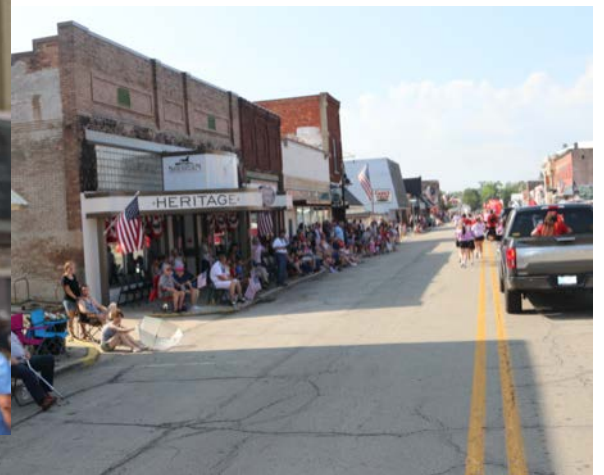
There was a great crowd in the front of the museum.