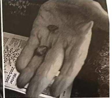
Persimmon seeds are slick and tricky to open; they reveal surprises.