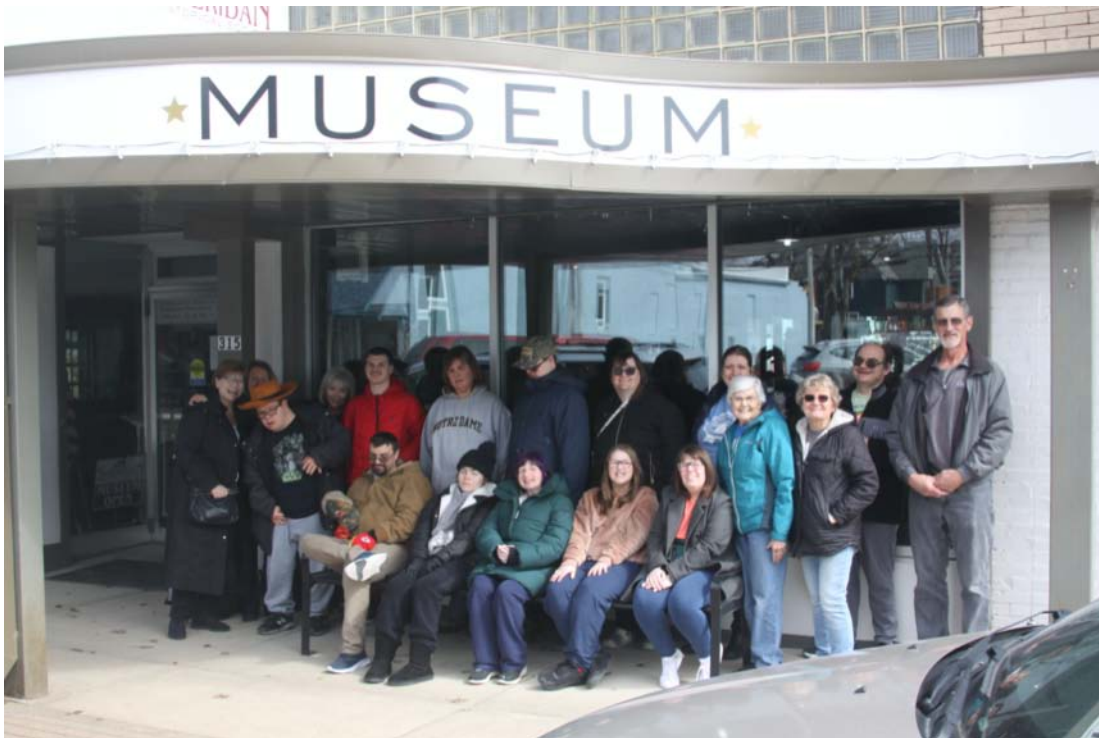
Mephibosheth Ministries A Developmental disabilities group from Cicero recently spent a day enjoying the museum.