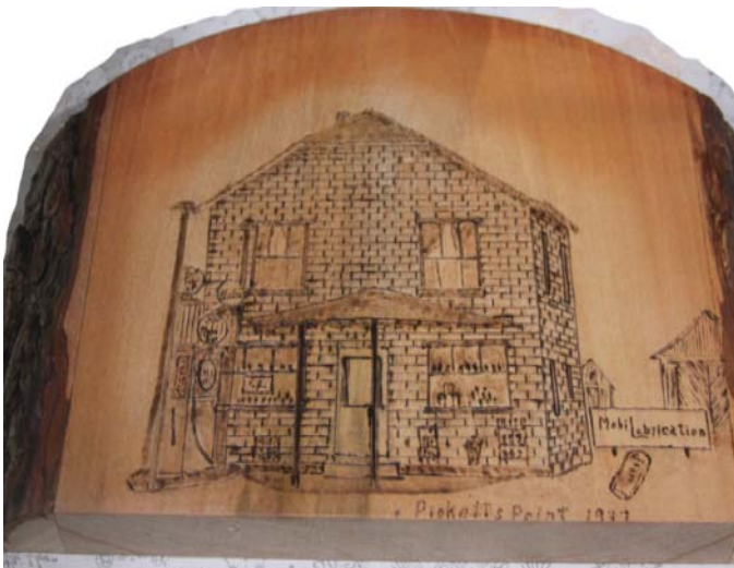
Carving of Pickett's Point (as shown in the article on page 1.)