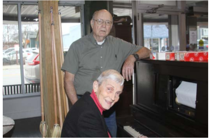
The History of Player Pianos